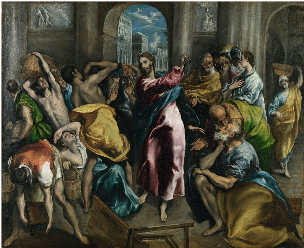
Christ Driving the Traders from the Temple , El Greco around 1600, National Gallery, London. A related article by Stephen Gilbert can be found on pages 23-24.